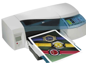
hp designjet 10ps printer

*HP remote proofing solution will be available at the beginning of 2002