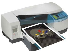
hp designjet 20ps printer